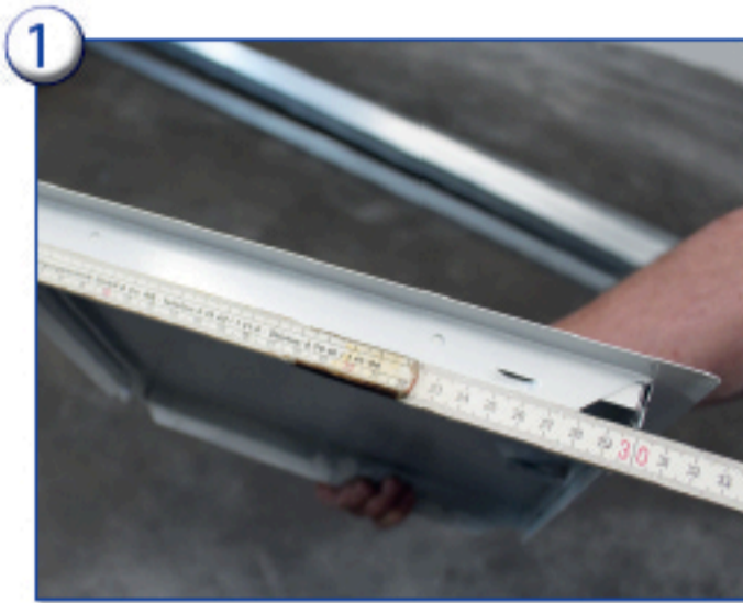
1 Measure out installation dimension of access panel.