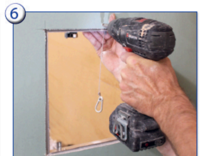
6 Fix frame.