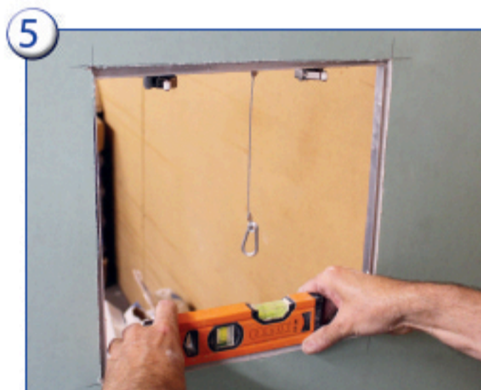
5 Adjust frame.