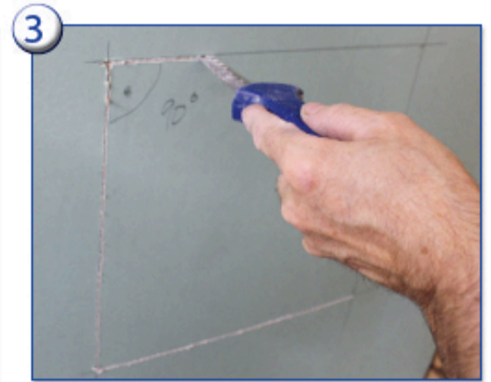
3 Saw out installation opening using a knife or a jigsaw. Precise working means less post-treatment afterwards.