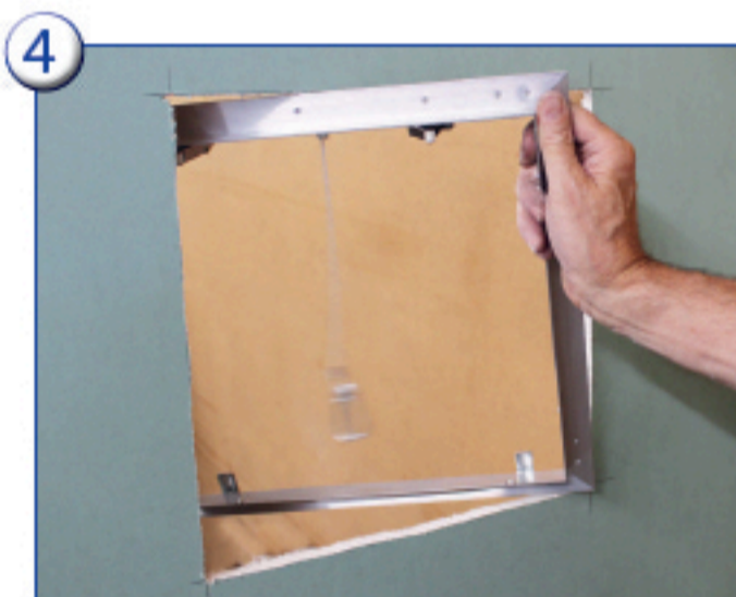
4 Pass frame diagonally through the cut-out.