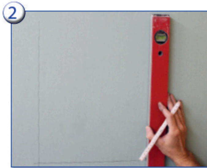
2 Mount installation dimension + 6 mm cut end on the desired spot. Make sure that the angle is 90°.