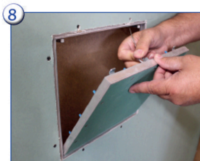
8 Secure door leaf with retaining cable.