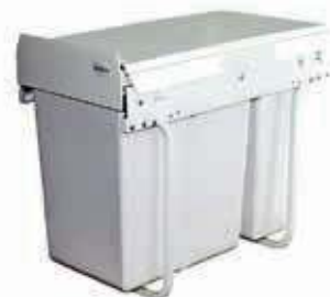
Model KRB30 1 x 10L & 1 x 20L Buckets Size 260W x 480D x 420H (mm) closed