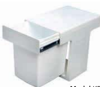
Model KRB16 1 x 15L Bucket Size 266W x 390D x 345H (mm) closed