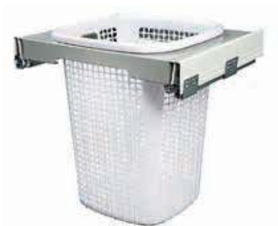
Model KLH5560 Size 518W x 500D x 560H (mm) Basket 60L