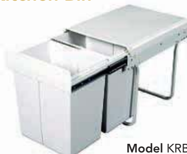
Model KRB31 2 x 20L Buckets Size 350W x 480D x 415H (mm) closed