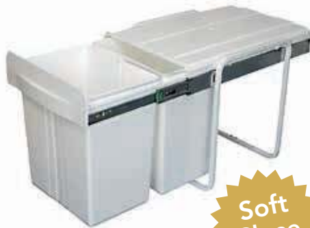
Model KRB310 Size 366W x 518D x 415H (mm) closed