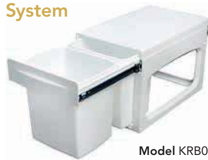
Model KRB08 2 x 15L Buckets Size 320W x 525D x 340H (mm) closed