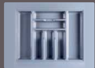
Model KCI09W (White) & KCI09G (Grey) Size 730W x 550D x 55H (mm) Min. Trim Size 580W x 440D x 55H (mm)