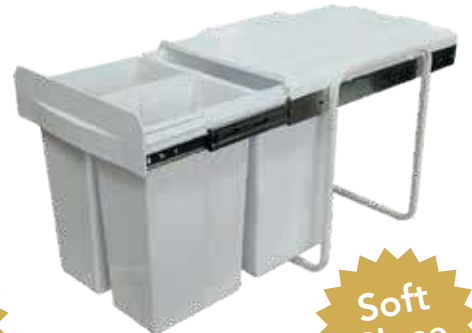
Model KRB320 Size 366W x 518D x 415H (mm) closed