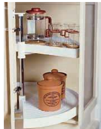
Model KLS02 Height 556mm Diameter 700mm Min. Cupboard Depth: 700mm