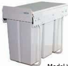
Model KRB32 3 x 10L buckets Size 270W x 480D x 420H (mm) closed