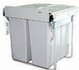
Model KRB41/41D 1 x 34L & 2 x 17L Buckets Size 529W x 494D x 540H (mm) closed