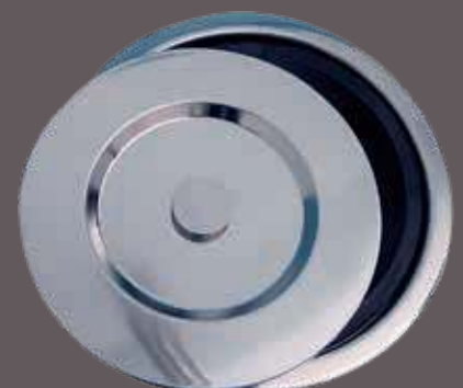
Model KRB13E Size 310Dia x 300D (mm) 430 Stainless steel grade.