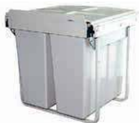
Model KRB40/40D 2 x 34L Buckets Size 529W x 494D x 540H (mm) closed