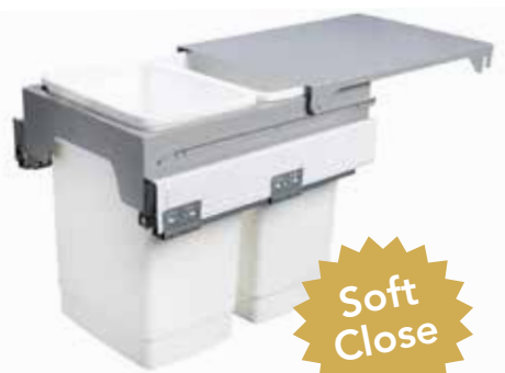
Model KRB60EP Size 414W x 520D x 500H (mm) closed High quality soft close draw runners

Superior integrated design with an automatic opening lid to conceal odours... the Lux in Waste Bins.