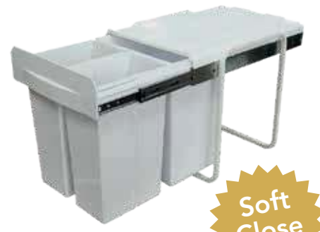
Model KRB360 Size 366W x 518D x 415H (mm) closed