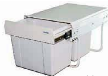
Model KRB33 2 x 13L Buckets Size 340W x 480D x 320H (mm) closed