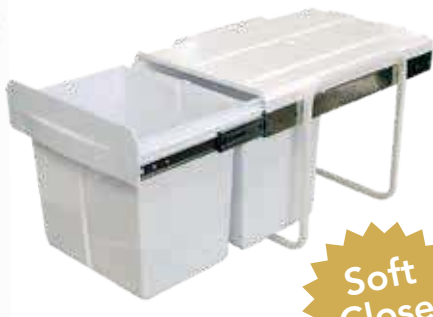
Model KRB330 Size 366W x 518D x 357H (mm) closed