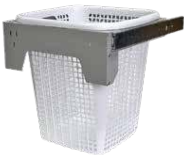
Model KLH4500 Size 418W x 534D x 440H (mm) Basket 45L