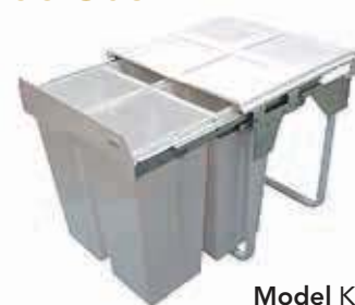
Model KRB42 4 x 17L Buckets Size 529W x 494D x 540H (mm) closed