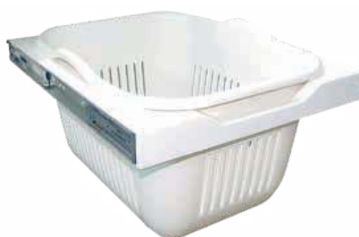
Model KLH600T Size 462W x 513D x 301H (mm) Basket 40L