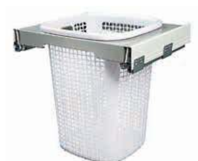
Model KLH6000 Size 568W x 500D x 560H (mm) Basket 60L