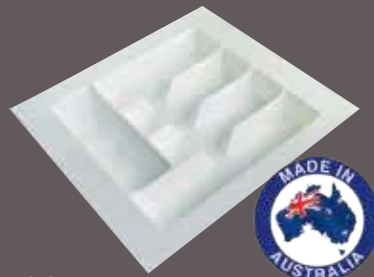
Model KCI01 Size 450W x 435D x 55H (mm) Min. Trim Size 306W x 346D x 55H (mm)