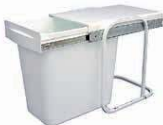
Model KRB14/14D & KRB15/15D (KRB15/15D Same as KRB14 but with a divider to make 2 x 22L buckets) Size 350W x 525D x 478H (mm) closed