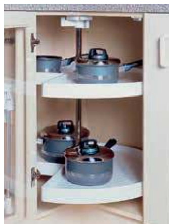
Model KLS01 Height Adjustable 615 - 732mm Diameter 700mm Min. Cupboard Width: 600mm (300mm each door) Min. Cupboard Depth: 700mm