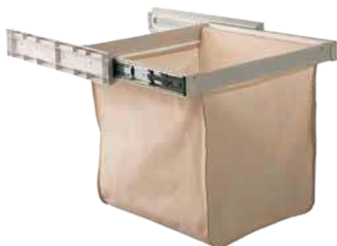
Model KLH600TF Size 565W x 510D x 465H (mm) Bag 60L