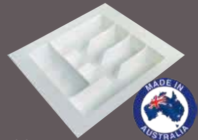
Model KCI02 Size 445W x 489D x 59H (mm) Min. Trim Size 372W x 370D x 59H (mm)