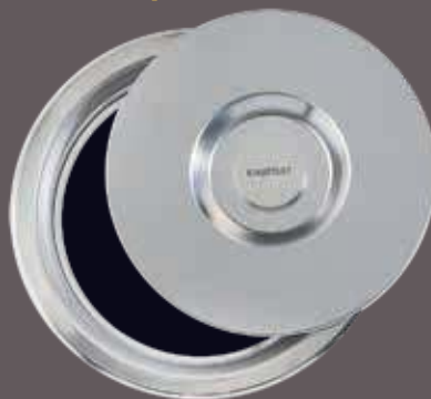
Model KRB10 Size 235Dia x 103D (mm) Rim and Lid 304 Stainless Steel grade and Knob 430 Stainless steel grade.