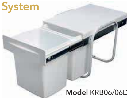
Model KRB06/06D 2 x 15L Buckets Size 350W x 525D x 340H (mm) closed